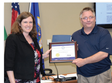
SWP Award with Mayor of Mankato, MN